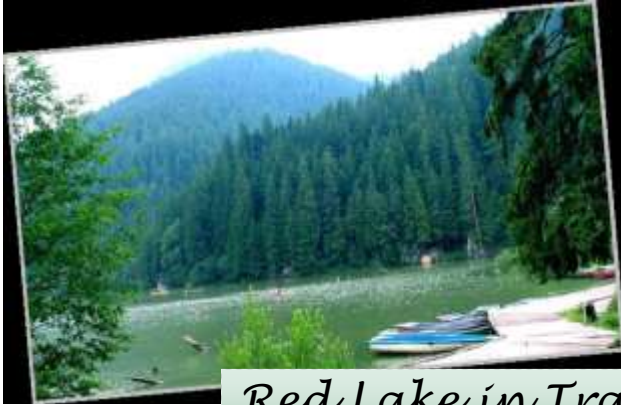
Red Lake in Transylvania.